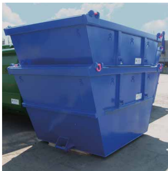
Symmetric skip - stacking