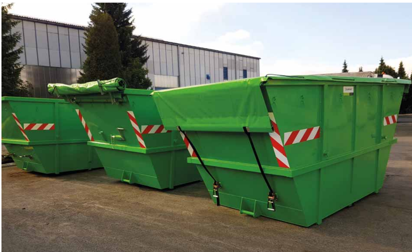
Securing tarpaulins to a symmetric container