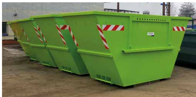
Symmetric skips - flat